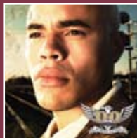
D.O.'s North Starr Album

The message is sure to remain because you will receive posters and a CD to play on the morning announcements before and after a Stay Driven performance. We've worked with educators to come up with photocopy friendly follow up material that teachers can use to ensure that our message stays with your students.